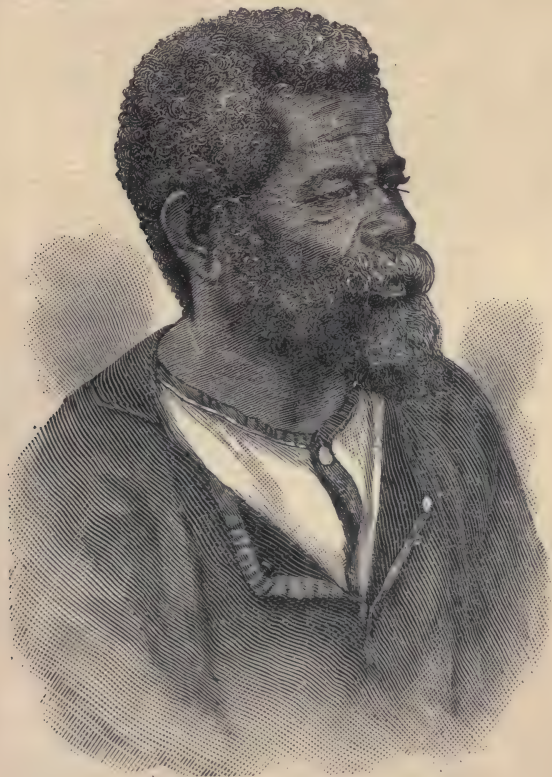
A NATIVE TEACHER.